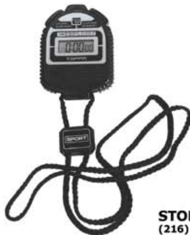
STOP WATCH (216)