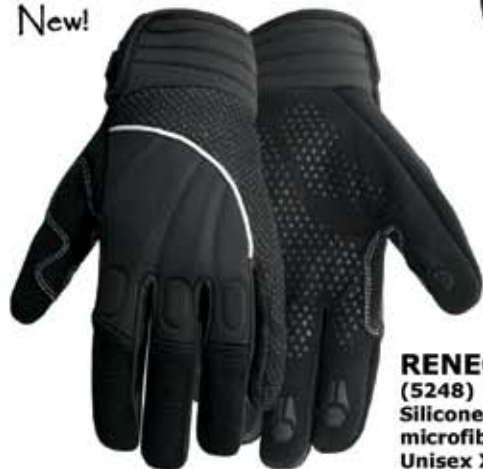
RENEGADE (5248) Silicone textured microfiber Unisex XXS - XL