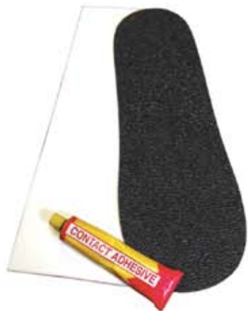
INSTALL KITS *See price list