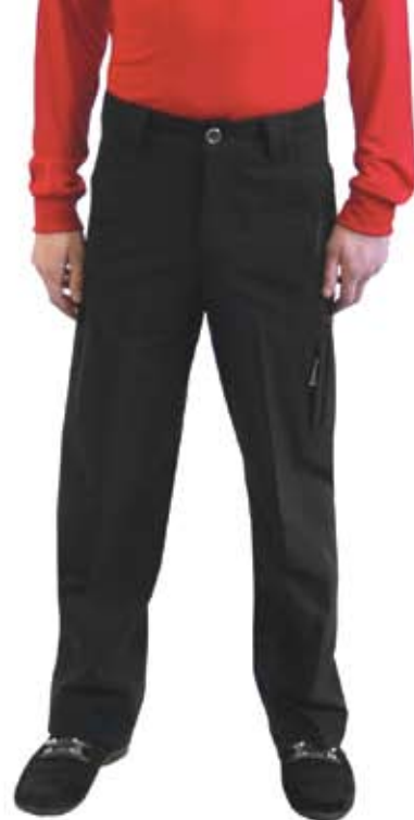
URBAN (4099) Ultra Sport, 4 way stretch XS - XXL