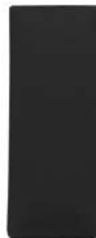
Synthetic (465-8) 8" Rectangular pad