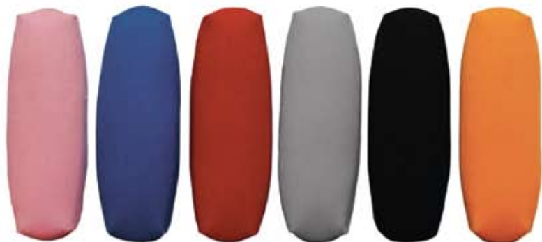
Synthetic (465-R2) Reactor2