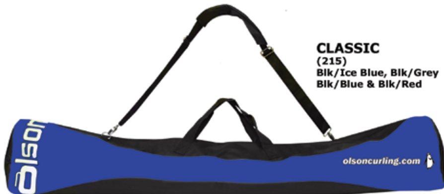
CLASSIC (215) Blk/Ice Blue, Blk/Grey Blk/Blue & Blk/Red