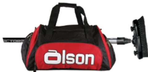
SPORT DUFFLE (215-D) Blk/Red, Blk/Charcoal & Navy Blue/Ice Blue Features: Velcro closures for brush attachment