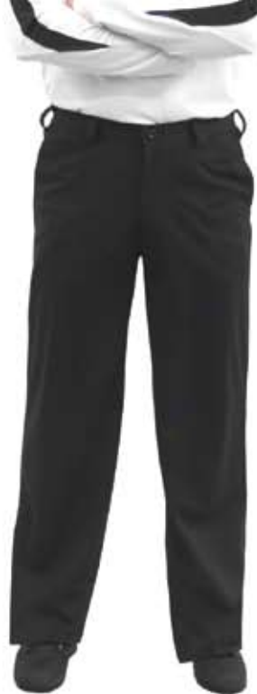
OXFORD (4095) Poly-Cotton S - XXL