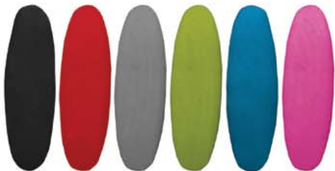
Synthetic (P4M) Perform pad All 2010 Olson models & Performance heads