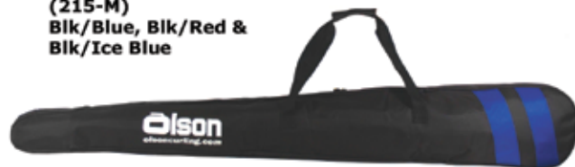
MINI (215-M) Blk/Blue, Blk/Red & Blk/Ice Blue