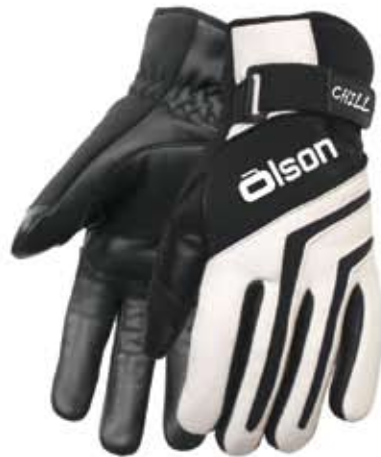
CHILL (5092) Lined black leather palms Extra lining for warmth Unisex XXS - XL