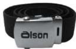
OLSON BELT (425)