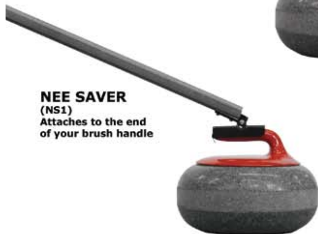
NEE SAVER (NS1) Attaches to the end of your brush handle