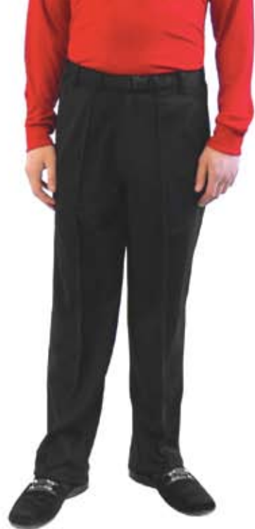
CLASSIC BELTED (4084) Poly-Cotton XS - XXXL