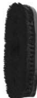
HORSEHAIR (465-R2H) R2, Vector & Olson 8"