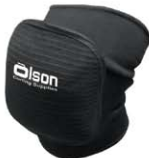
KNEE PAD (212-K)