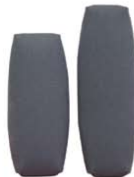
Synthetic (422-6 & 422-8) Olson 6" & 8" or Vector