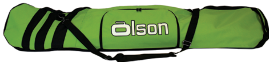
INDIVIDUAL (215-I) Key Lime (as shown)