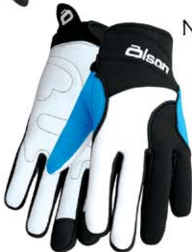
ICE (5991) Padded white leather palms Ladies S - XL